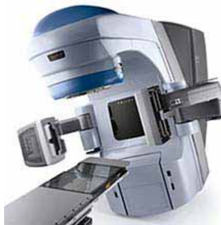
Varian IX installed at Lourdes